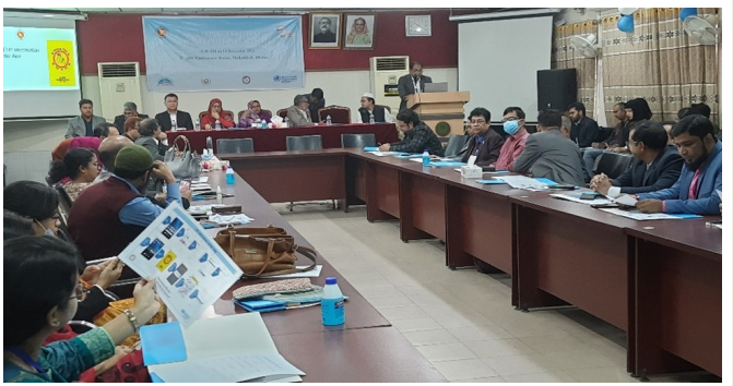
Program Manager shared the EPI vaccination center app

With the support of WHO, this app has been developed. GPS location, including particulars of vaccination centers in all 12 city corporations, has been included in this app. The app will provide detailed information about centers so that beneficiaries can access vaccination services easier. National EPI launched EPI Vaccination Center App the in the presence of chief health officers of all city corporations, civil surgeons of districts, WHO, Unicef, and other stakeholders.